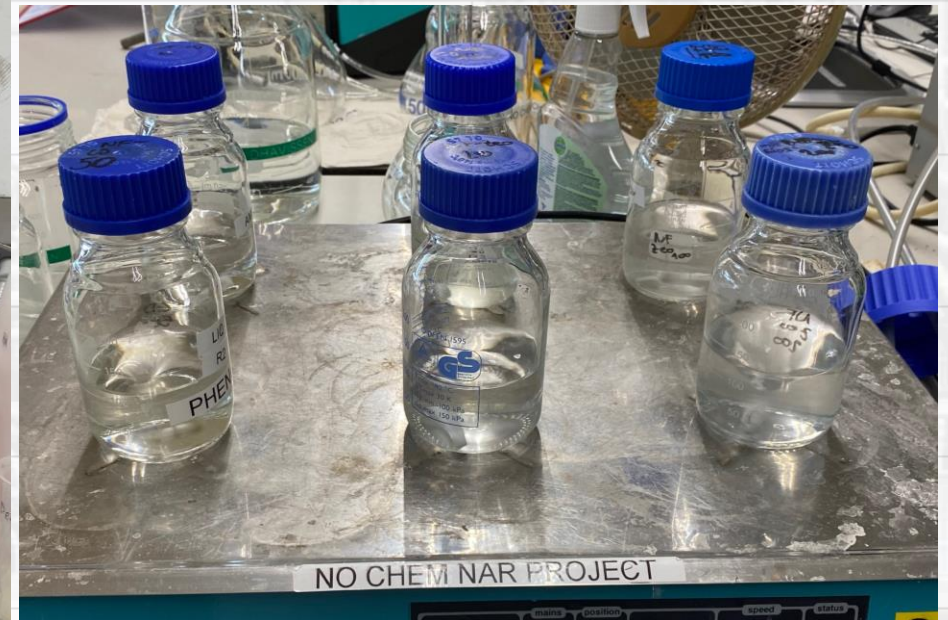
All-silica BEA zeolites