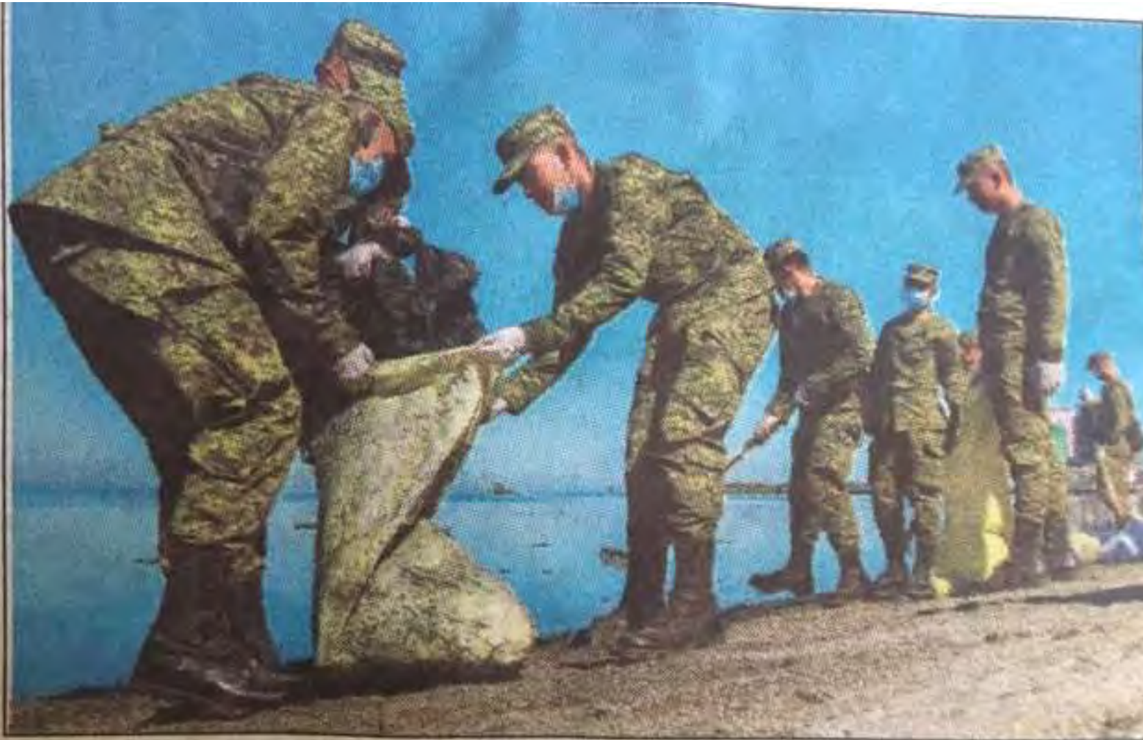
More than 1,000 Army soldiers gather garbage from the shoreline of Manila Bay in Parañaque City yesterday to support the government program to rehabilitate the bay.